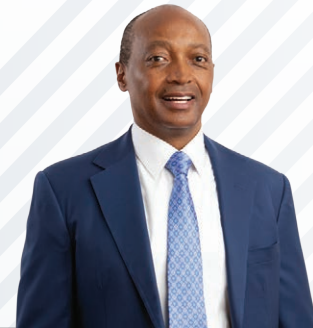
1 DR PATRICE MOTSEPE (57) ● Executive chairman