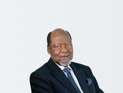
11 JOAQUIM CHISSANO (79) ● Independent non-executive director