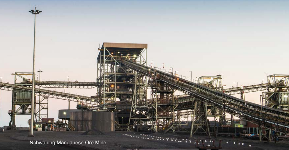
Nchwaning Manganese Ore Mine